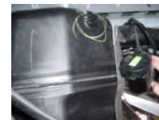
Step 4: Install Turnover Ball Center Section.