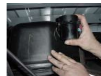
Step 3: Slide fuel valve from bracket.