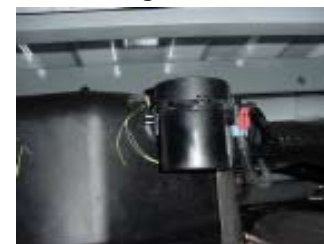
Step 1: Locate the fuel valve.

Beginning in 2004, a fuel valve mounted on the rear of the fuel tank on trucks equipped with gas engines, makes it more difficult to install the Turnover Ball center section. This fuel valve can be easily removed and replaced to ease installation. Please follow the following instructions: