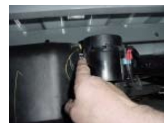
Step 2: Disengage the locking pin.