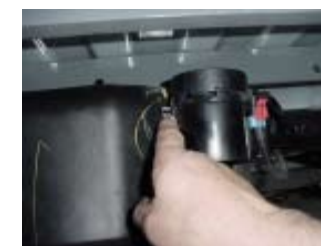
Step 2: Disengage the locking pin.