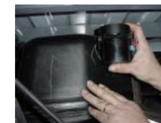
Step 3: Slide fuel valve from bracket.