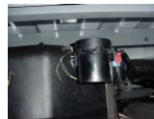
Step 1: Locate the fuel valve.

Beginning in 2004, a fuel valve mounted on the rear of the fuel tank on trucks equipped with gas engines, makes it more difficult to install the Turnover Ball center section. This fuel valve can be easily removed and replaced to ease installation. Please follow the following instructions: