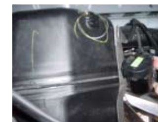
Step 4: Install Turnover Ball Center Section.